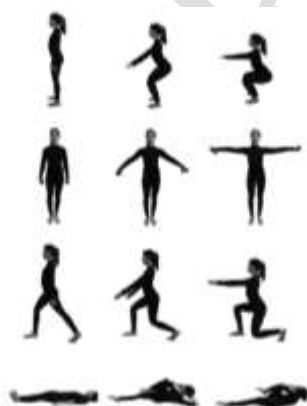
Figure 1 - Illustration of some basic movements included in the functional training.

The participants of this group received 12 weeks of functional training intervention for PwP following the proposed study protocol, lasting 60 minutes each session/class, with an evolving intensity, and a frequency of twice a week. Each session had the following division: a) warm-up (15 min); b) main part (40 min); and c) back to calm (5 min). The initial warm-up started with natural movements, such as walking, running, and displacements, followed by general and specific joint movements, performing movements in different joint axes (flexion, extension, abduction, adduction, and rotation), and progressing from the upper to the lower body. The main part of the session focused on the gradual evolution of the difficulty of functional training movements, including the gain in limb and trunk muscle strength through squatting, stepping, sitting down and getting up from a chair, abduction/adduction, hip extension/flexion, and activation of the abdominal muscles when performing flexions, extensions, and trunk rotations. Finally, the training returned to calm, with the goal of relaxing the muscles worked during the session, by performing static stretching movements, slow walking, massages, and myofascial release.