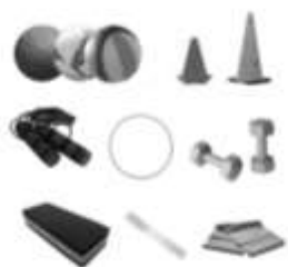
Figure 2 - Materials used in the classes.

The materials used during the phases of the classes were varied according to the proposed activities (figure 2), allowing for variations in the exercises and increased intensity.