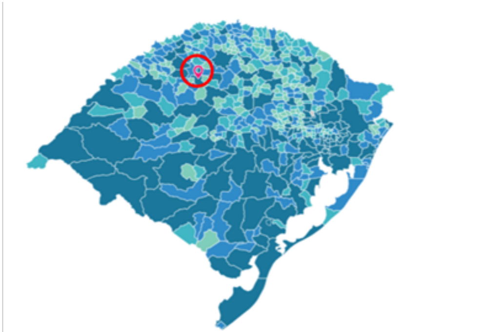
Figure 1 – Location of the municipality of Ijuí on the map of the State of Rio Grande do Sul – Brazil.

beings of the Regional University of the Northwest of the State of Rio Grande do Sul – Unijuí, under substantiated opinion nº 5.019.922 and CAAE nº 51638321.0.0000.5350. This is a Research-Service Project developed in technical-scientific cooperation between the Regional University of the Northwest of the State of Rio Grande do Sul and the Municipal Health Department of Ijuí/RS/Brazil. The data analyzed is from August 2021 to December 2022, collected in the Family Health Strategies (FHS) in the urban area of that municipality of Ijuí (Figure 1).