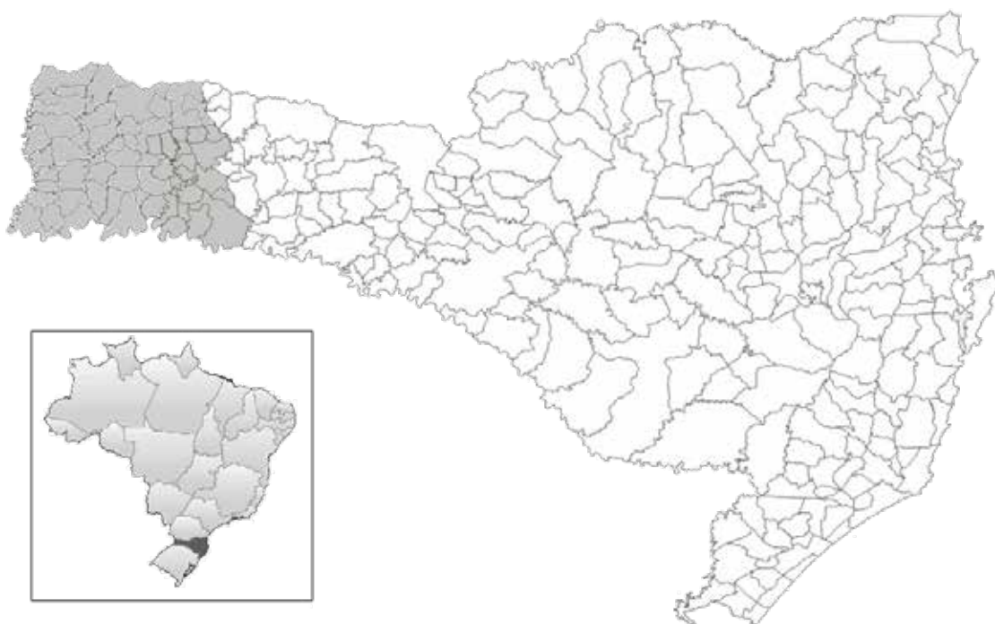
Figure 1 – Region/municipalities object of study

The criterion of selection of the investigated region is associated to the fact of being the most distant region of the capital of the state. Because of bringing together a great number of small local authorities, with characteristics of having urban and rural productive systems, which segregates the residues profile and enlarges the range for the collection, specially for the spacious wrapped territorial areas and operational costs for the efficient management of the system of collection, according to Figure 1.