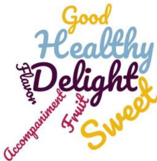
Figure 4 - Word cloud associated with the consumption of fruit jelly.