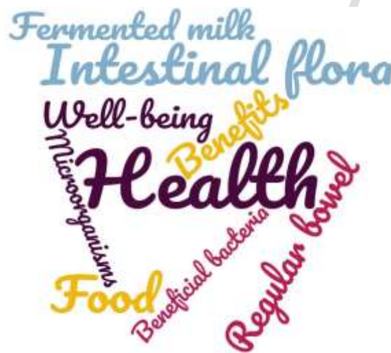
Figure 3- Word cloud associated with probiotic product/food.