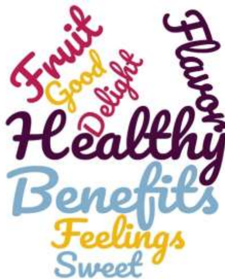
Figure 5 - Word cloud associated with fruit jelly containing probiotics.