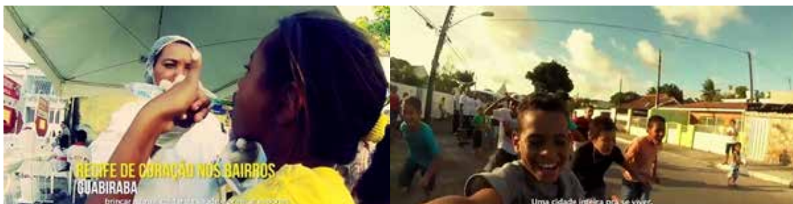
Figure 5 – Integration and participation of communities in the districts

In all 03 projects approached in this research it is possible to assume that they are dedicated to the residents of the city, aiming a to create a better city to live, to enjoy, to have a healthier life, to promote more contact with a local culture. Although the projects involve changes in habits, these involve three positive aspects for humans: (1) better health, (2) greater access to local culture and (3) greater social coexistence with less concern with urban violence.