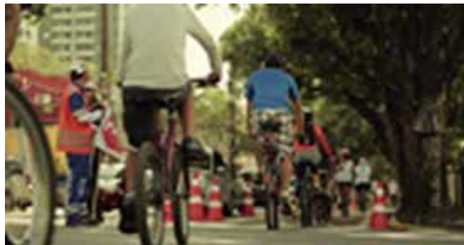
Figure 4 – The use of bike lanes

This statement has two main biases, namely: (1) an attempt to promote urban mobility in the non-working days and (2) an initiative to promote the habit of change if the insertion and motivation for a healthier lifestyle. What actually happens is encouraging the use of bicycles for entertainment on weekends, thus creating the possibility of knowledge of historic and natural beauty of the city, a healthy mobility option that generates no pollution, no traffic jams, and expansion of social coexistence.