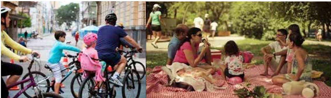
Figure 6 – Local population involved in the activities provided by the local government

The “corpus” used in this research, almost entirely presented images showed that all these projects are enjoyed and structured to certain population profiles, namely younger citizens and young families. Thus, it’s possible to affirm that the pictures deny words, since these projects are presented as a means of social inclusion. This apparently contradictory is capable of understanding the extent that analyzes and highlights the aspects of promotion, publicity and persuasion presents in public activities and policies.